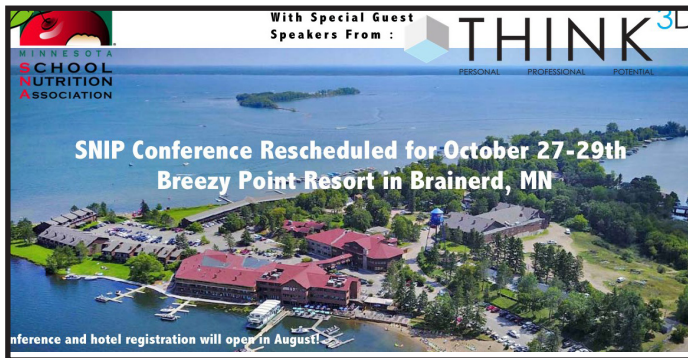
Breezy Point Resort Breezy Point MN

Due to the pandemic, MSNA has made the decision to reschedule the 2021 SNIP conference from May 6-8 2021 to October 27-29, 2021. It will still be held at Breezy Point Resort, Breezy Point MN. In light of current COVID-19 concerns, MSNA will continue to follow state and national recommendations and have safety protocols in place for all who attend.