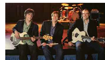
Slip Twister will be our high-energy entertainment on Tuesday night. Visit glberg.com/slip_twister to learn more about this band, whose motto is "Slip Twister is not having fun until you're having fun - and you WILL have fun!"